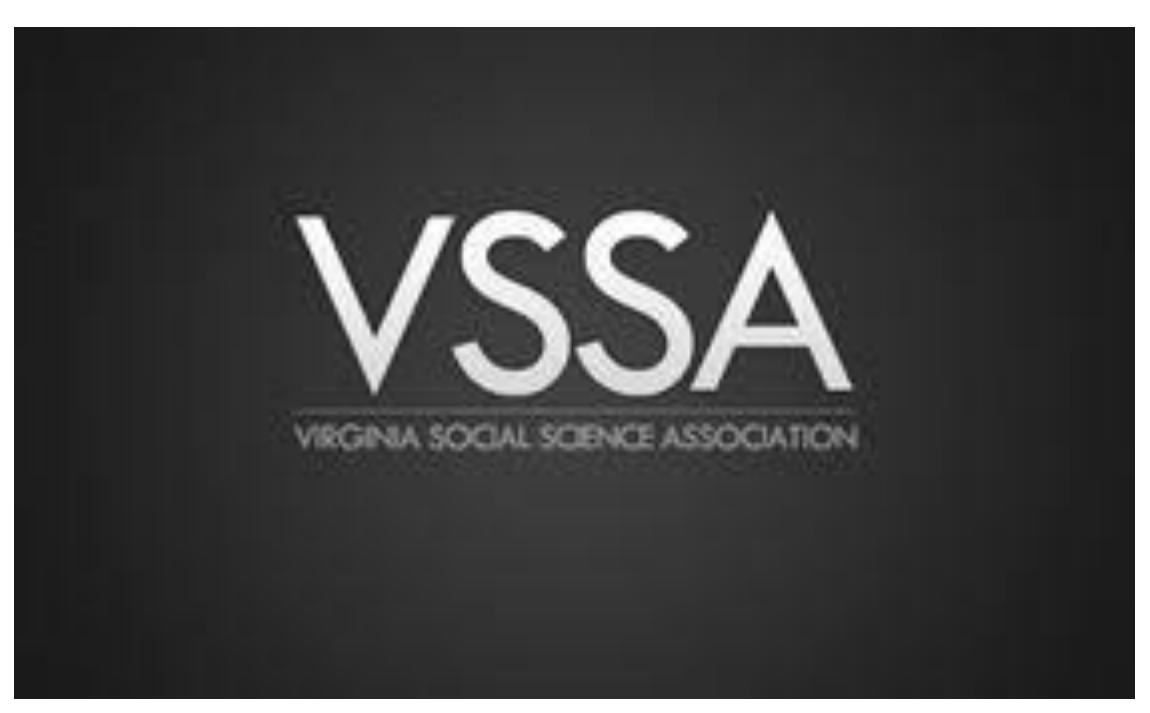
97<sup>th</sup> Annual Virginia Social Science Association Conference